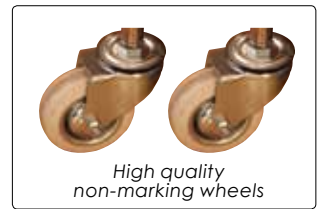
High quality non-marking wheels